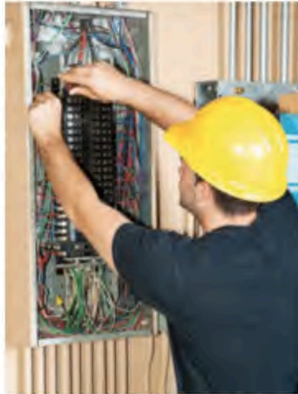
Installed at the breaker panel the Power Perfect Box reduces EMFs by up to 99% and THD up to 98% depending on the system.

Meanwhile, the U.S. National Institute of Environmental Health Sciences (NIEHS) concludes that scientific evidence is weak, and therefore EMF exposure should not be included in discussions about the ill-effects of tobacco and other products that